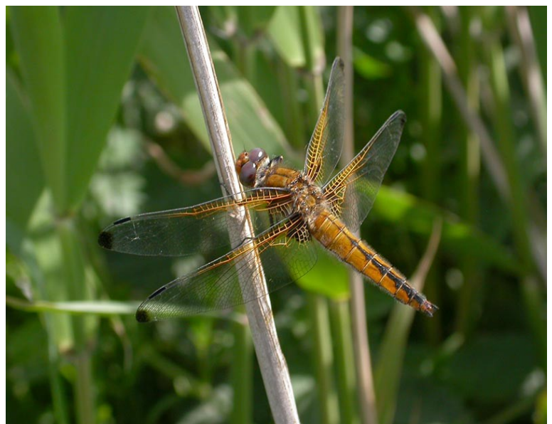
The Scarce Chaser dragonfly

April also brings the world's most-travelled bird to our part of the world, but you need to be quick to catch it! Arctic Terns