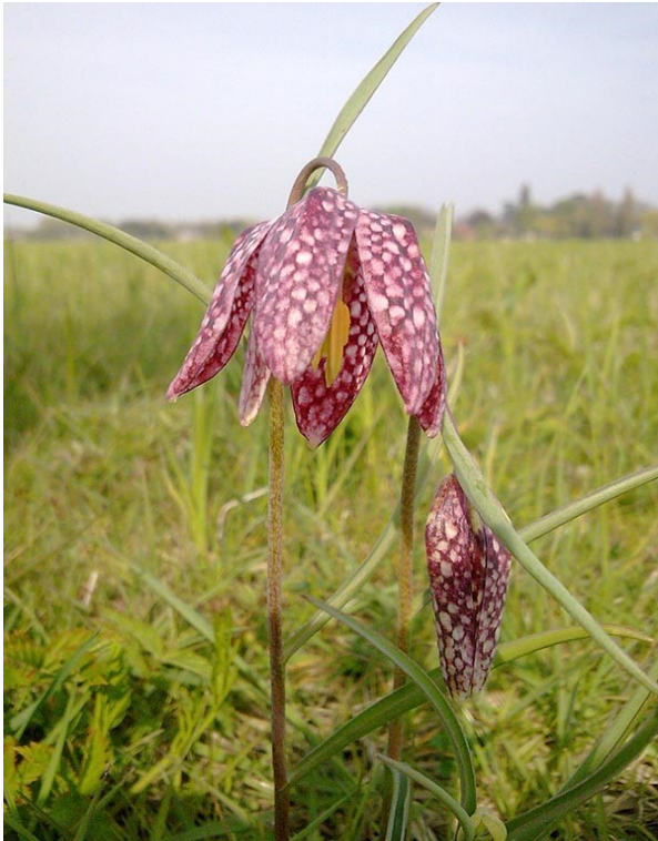
The Snake's-head Fritillary

In the first of a new quarterly column, local author and naturalist Mark Ward highlights some of the exciting wildlife to look out for in the Buckden area over the next three months.